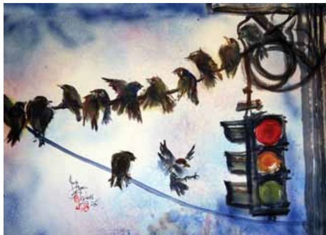
Wednesday morning club

remaining paint, I did the entire auditorium of Strough JH in Rome with 8 panels, 17 feet high. The following year I attacked the 5,500 square-foot Patriot Wall in Rome. I did a few smaller paintings around the city and sometime in this period began to paint my figure class demos in watercolors, life sized. The paper never seemed large enough! My figures spill out of bounds, with limbs off the edges.